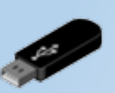
Data Transfer via USB