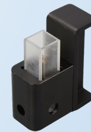
Cuvette port, available on the M9611 model