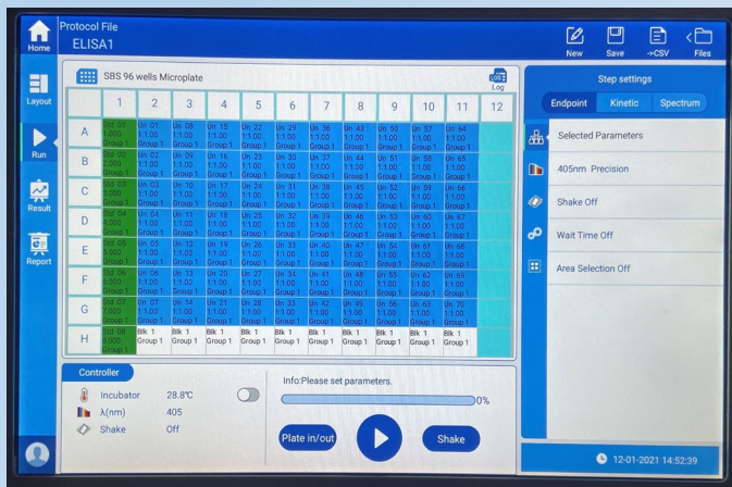
96-well Plate Layout Screen