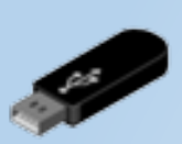
Data Transfer via USB