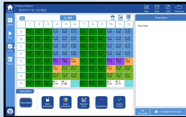
96-well Reading Result Screen