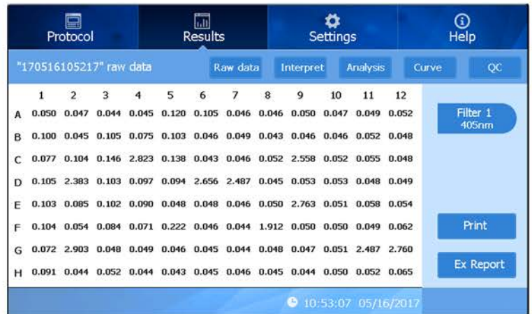
Reading Results Screen

Measurement data is available immediately on the screen after a reading, as well as interpretations, calculated analysis and curve fittings.