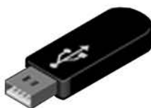
USB File Storage