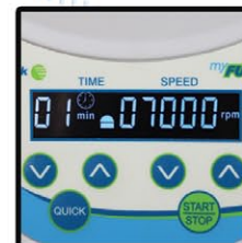
Digital display and control